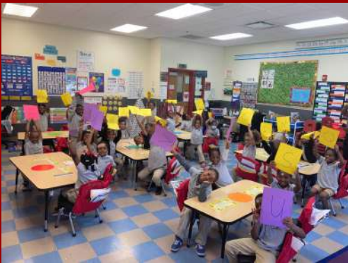
ISU, Kindergarten, celebrating Chicka Chicka Boom Boom